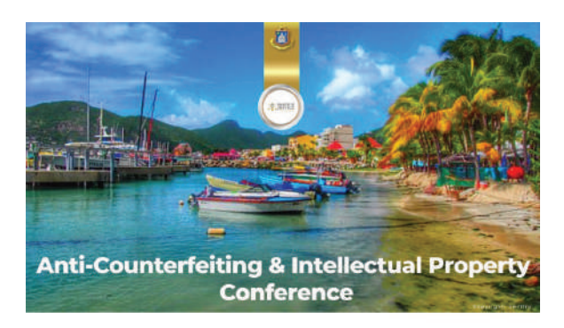
titry of Justice will be hosting 35. Miantamik First Annual Locations matchings and individual Property Contension matchings and individual ADV and a strandards taking ference alter to activite average of the Ministry's creating a realised and-counterfering strategy for the together with DIGOS from Protection Services.

This event was hosted and organized by the Ministry of Justice Sint Maarten, which brought together relevant stakeholders from Sint Maarten, Latin America and Europe to raise awareness about the dangers of counterfeit and the importance of enforcement.